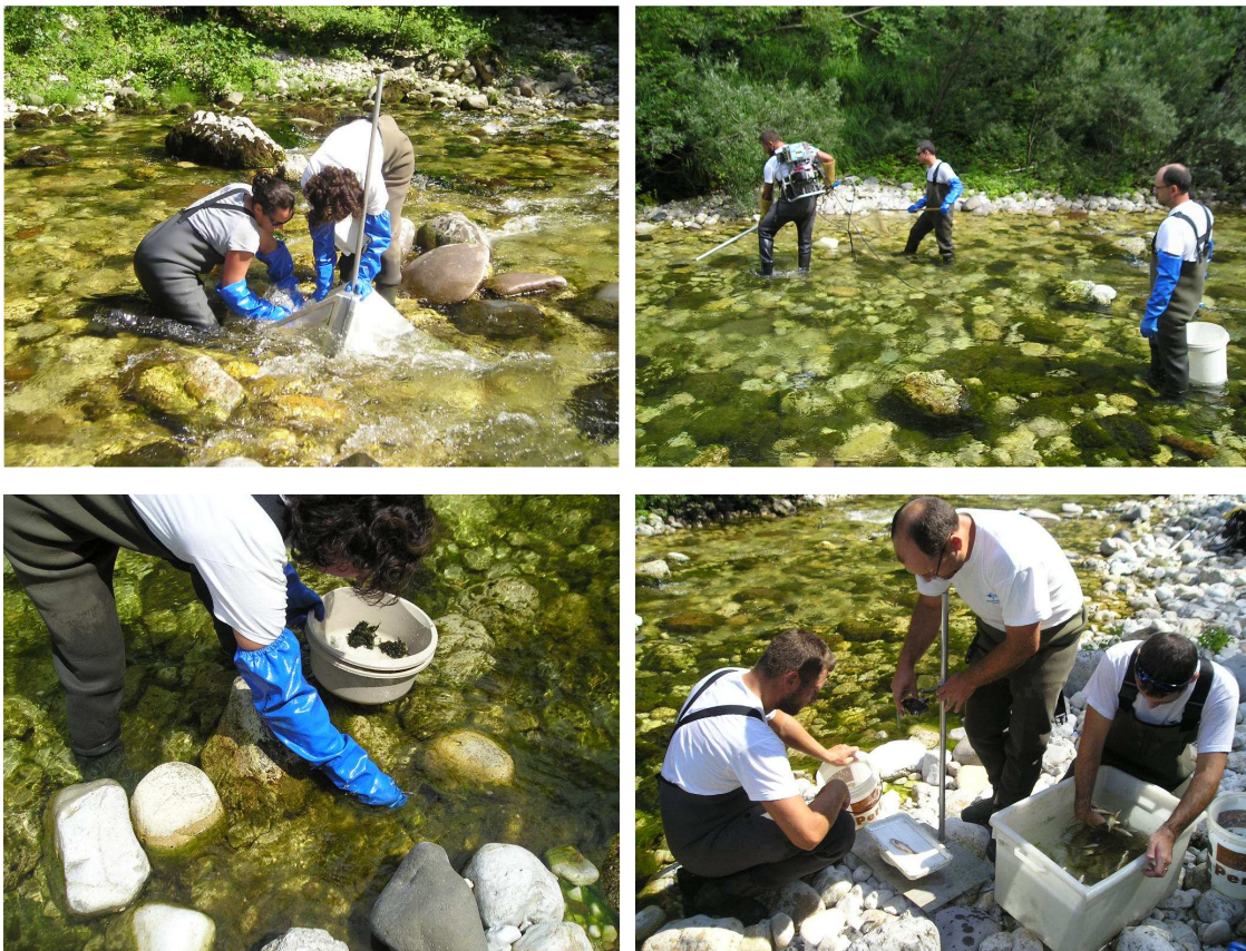
Figure 1: chemical and biotic field surveys along the Astico river downstream the Leda dam